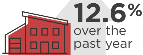
2-bedroom unit in Ohio