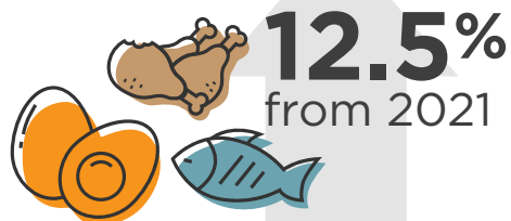
Meat, fish, and egg prices

Despite having recovered 85% of jobs lost during the COVID-19 pandemic, high inflation has wiped out many gains Ohioans had made.